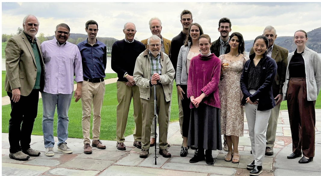
Cooperstown-based board members of the Medical Alumni Association enjoyed a social gathering recently at The Otesaga Hotel with current medical students and residents in training at Bassett Medical Center.