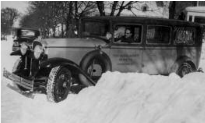
Bassett ambulance, circa 1930. Ah, those Cooperstown winters...

From time to time, we'll present a picture or two to capture an event or people in Bassett's past. Enjoy reminiscing!