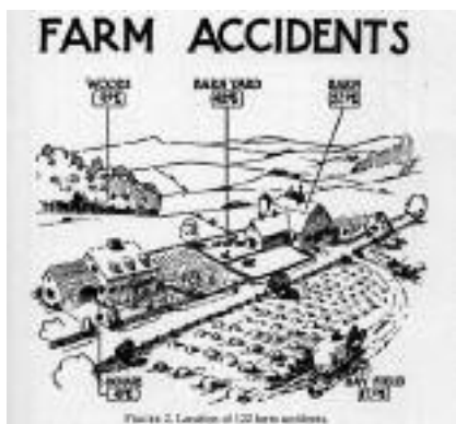
Shown here is a figure from the 1938 Bassett Rural Medicine Symposium.