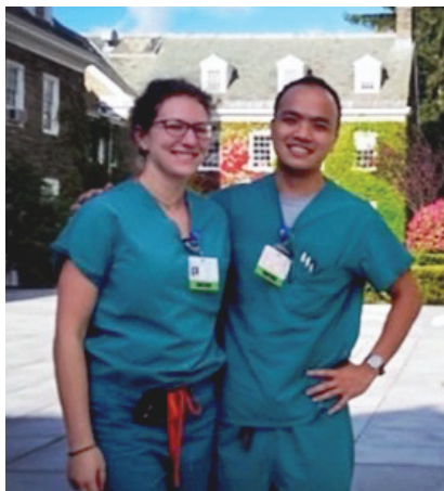
Here is a photo of us in Vietnam, and a photo of us as interns at Bassett."